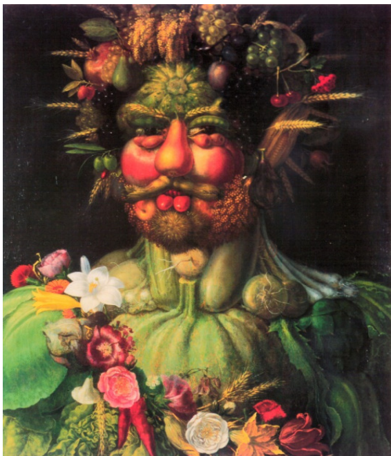
ARCIMBOLDO - Emperor Rudolf II as Vertumnus 1591